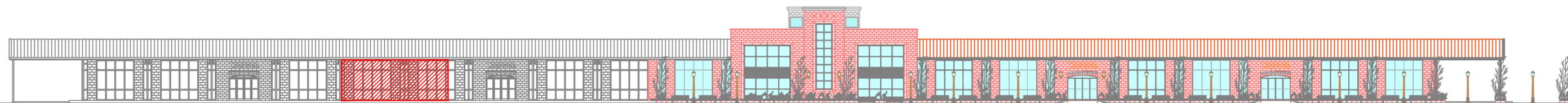
FACHADA DELANTERA E = 1/500